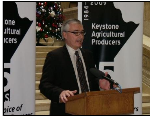
Above: Agriculture Minister Stan Struthers